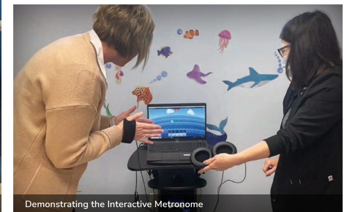
Demonstrating the Interactive Metronome