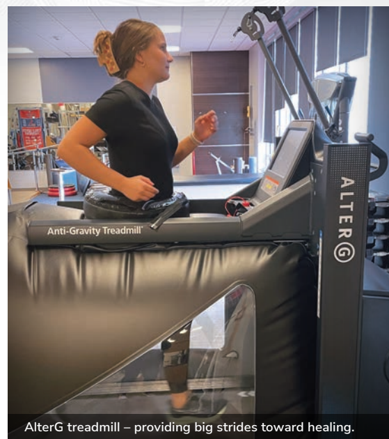
AlterG treadmill – providing big strides toward healing.

From individual donations to grassroots giving circles to our iGIVE employee giving campaign and beyond, annual giving is an important part of philanthropy. We're incredibly grateful to the 4,750 donors who gave $2 million in 2023 , transforming healthcare in every community we serve.