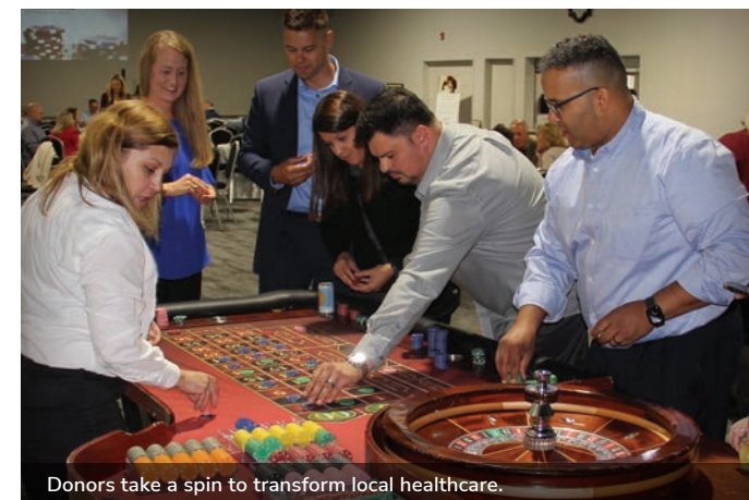
Donors take a spin to transform local healthcare.

Friday the 13 th isn't normally associated with good luck. But last October 13, Carle Health Center for Philanthropy set out to change that with "High Rolling for Health," a special casino night event designed to raise money for Carle Richland Memorial Hospital. There were six themed sponsorship levels, ranging from "One Pair" with seats for two, to a "Royal Flush" that earned donors reserved seating for 10, a logo in the program and other various perks. More than $34,000 was raised for the Carle Richland Greatest Needs Fund, which'll be used to support local healthcare initiatives in the greater Olney area.