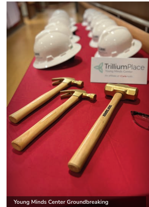
Young Minds Center Groundbreaking

When the Carle Auxiliary opened the Carle Auxiliary Guest House in 2003, it was one of their proudest moments. Since then, the Guest House has served as a home away from home for over 35,000 guests arriving at Carle Foundation Hospital from every state and countless countries. Designed to accommodate the families of patients receiving lifesaving care, the beautifully appointed house has 13 rooms, including three family suites that can welcome up to four guests. On average, 1,500 guests each year use the facility, which includes a pantry stacked with breakfast food, snacks and other items to keep them energized throughout the day. It costs about $275,000 a year to operate the home, but no guest ever sees a bill – all thanks to proceeds from Carle Auxiliary fundraisers, gift shops and the Carle Auxiliary Resale Boutique, as well as generous contributions from donors. We're grateful for the hard-working staff and Auxiliary volunteers who make sure the Guest House doors are always open for families with loved ones in our care.