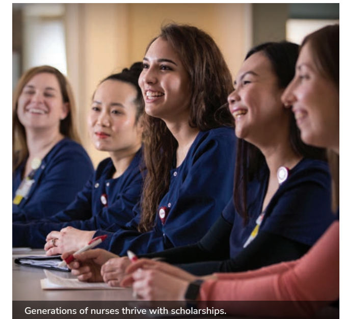
Generations of nurses thrive with scholarships.