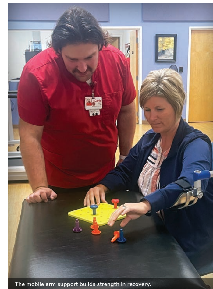
The mobile arm support builds strength in recovery.

There are many simple and low-cost tools that can be used to help rehab patients regain their strength and mobility, but occasionally, more expensive tools are needed. When those tools fall outside the departmental budget, philanthropy can help close the gap. That's the story at Carle Richland Memorial Hospital, where therapists recently asked for help purchasing several new patient-related items, including a vibration plate, a mobile arm support and an interactive metronome. The new vibration plate can help children needing to regain muscle strength, as well as adults with osteoporosis and other bone-density issues. The mobile arm support assists stroke patients by offsetting the weight of their arm, making it easier to control their movements and regain strength. And the metronome makes therapy fun, with 24 interactive video games that challenge patients to synchronize a range of whole-body exercises to a musical beat.