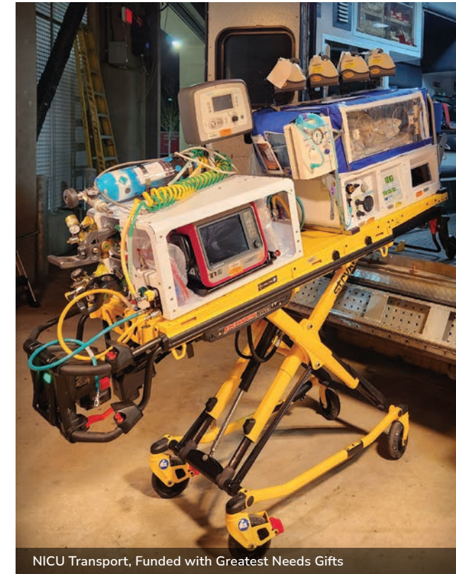
NICU Transport, Funded with Greatest Needs Gifts