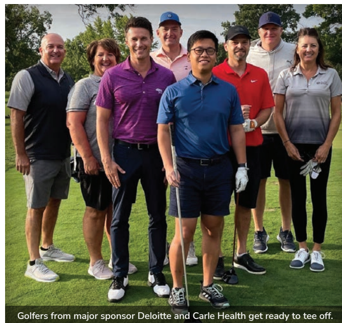
Golfers from major sponsor Deloitte and Carle Health get ready to tee off.

Every year, the Carle Golf Open raises thousands of dollars to support patient care in the Champaign-Urbana area. And in 2023, the event was one for the records. Thanks to the generosity of Hall Render Killian Heath & Lyman, our title sponsor, along with 80 other sponsors and more than 350 golfers, the two-day event at the Urbana Country Club raised $442,030 to provide education awards through the Building Racial Diversity in Nursing initiative. Our sponsors come back year after year because they enjoy the Golf Open experience, but even more so, they appreciate the opportunity to help further the world-class care at Carle. We're grateful for them and for the many Carle Health staff members and volunteers who make the event memorable.