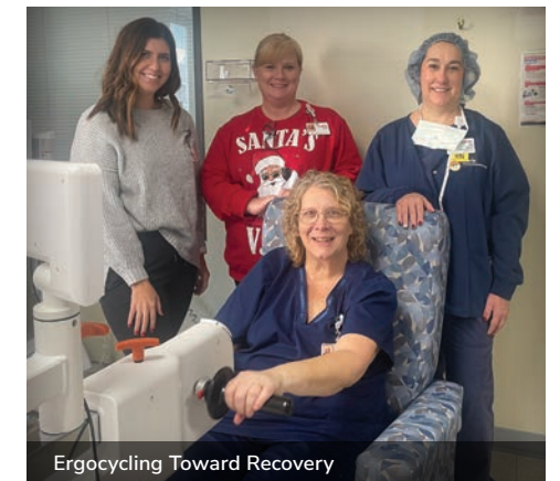
Ergocycling Toward Recovery

It may have a funny-sounding name, but the new ergocycle at Carle Richland Memorial Hospital is helping rehab patients make serious strides in their recovery, thanks to its broad capabilities and flexible design. The new cycle, which was funded through a $17,000 gift from the hospital's Auxiliary Council, allows patients to exercise their arms and legs simultaneously, and can be adjusted to do as little or as much as a patient needs to enhance their recovery. The ergocycle works both forward and backward – to exercise different muscles – and it can even be used by patients who can't get up out of bed. The new machine has been at the hospital since August and has already seen wide use – giving renewed strength and hope to patients on their journey of recovery.