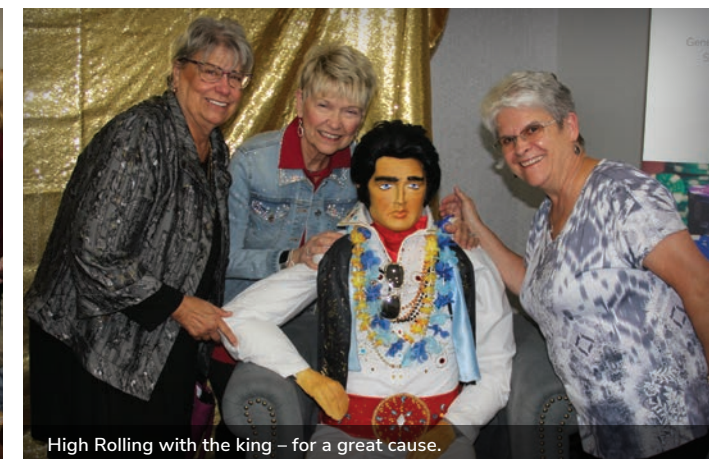
High Rolling with the king – for a great cause.